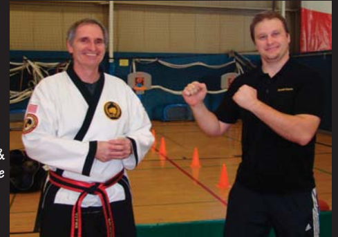
Trowbridge Martial Arts Academy & Seventh Heaven Massage