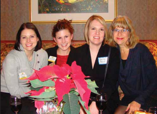
December Business Social Hour - Holiday Inn Hotel & Suites