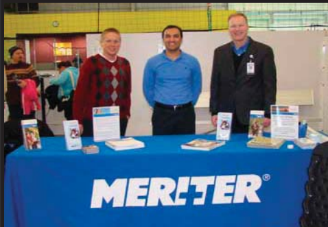
Meriter Medical Clinic